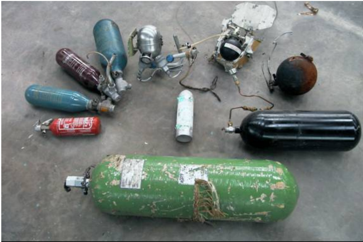
Figure 1. A selection of pressurized containers recovered from aircraft accidents

3.3.6 Pyrotechnics and explosives. Most commercial and many private aircraft carry custom-built explosive charges to initiate escape slides, parachutes, fire extinguishers, cable cutters, flotation gear, deployable emergency locator transmitters, etc. Whilst the activation of these charges may pose only a small direct risk to personnel, the unexpected initiation of the systems that they operate may present a more significant risk. Pyrotechnics are carried by a variety of aircraft and therefore may be discovered amongst the aircraft wreckage. They sometimes sustain impact damage and, as a result, pose an increased risk of initiation. Weapons may also be carried by passengers or crew as cabin or stored baggage and should be carefully treated. In the early stages of the crash investigation, perhaps at the reporting phase, co-ordinating personnel should seek information about any pyrotechnics or explosives known or thought to be on board the crashed aircraft and the information passed to the Investigator-in-charge. These hazards also support the need for adequate police resources to restrict the public and media from access to the accident site for their own protection.