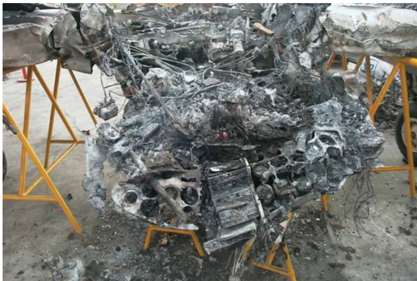
Figure 2. Fire damage to cockpit and avionics

3.5.5 Traditionally, aircraft structures consist primarily of aluminium alloyed with small amounts of other metals including magnesium, zinc and copper. Advanced materials are under development or are already in use in new metal alloys. The properties of many of these materials, when damaged, are not well understood.